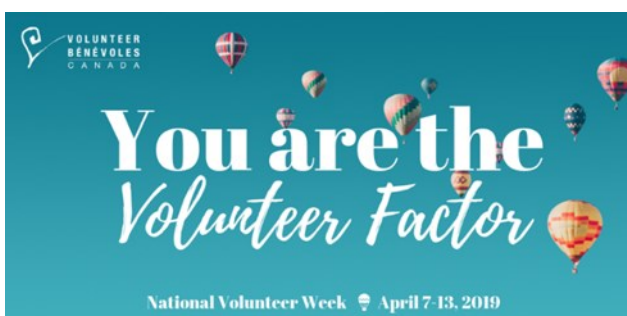
Brainwaves Summer 2019

If you'd like to learn more about BICR's volunteering opportunities contact karnold@bicr.org