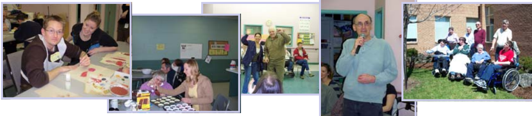
Pictures from PET Activities