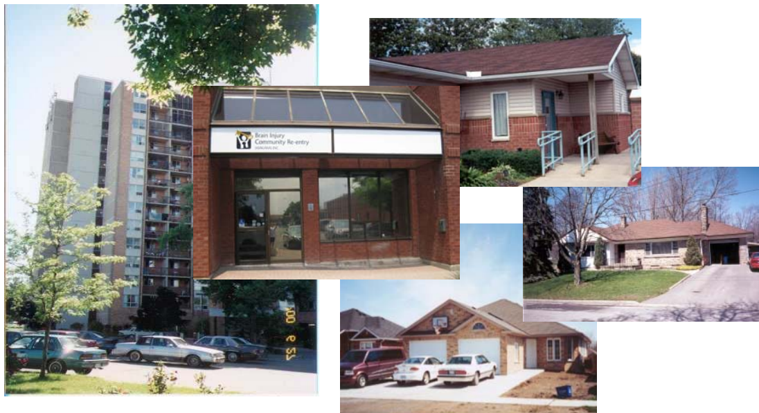
Pictures of Buckley Towers Complex, St. Lawrence, Parkdale and Richardson Court Residences.

BICR was founded in 1988 by a group of concerned parents and professionals who felt that specialized services were needed in the region. A volunteer Board of Directors consists of an organization founder, rehabilitation professionals and other community partners, oversees our programs. Funding is provided by a variety of sources including the Hamilton Niagara Haldimand Brant Local Health Integration Network (HNHB LHIN) and the Ontario Ministry of Health and Long Term Care, third party payers, fundraising and private donations.