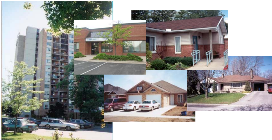
Pictures of Buckley Towers Complex, St. Lawrence, Parkdale and Richardson Court Residences.

BICR was founded in 1988 by a group of concerned parents and professionals who felt that specialized services were needed in the region. A volunteer Board of Directors consists of an organization founder, rehabilitation professionals and other community partners, oversees our programs. Funding is provided by a variety of sources including the Hamilton Niagara Haldimand Brant Local Health Integration Network (HNHB LHIN) and the Ontario Ministry of Health and Long Term Care, third party payers, fundraising and private donations.