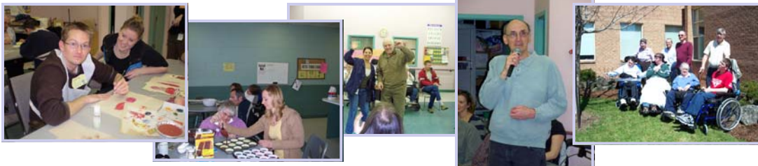
Pictures from PET Activities